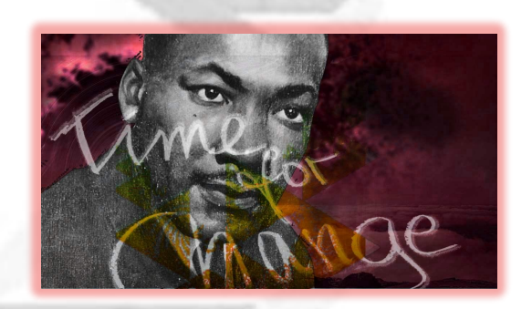
I am an emissary.