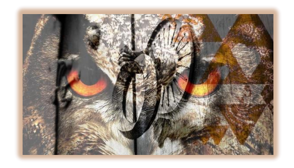
I am a seeker.