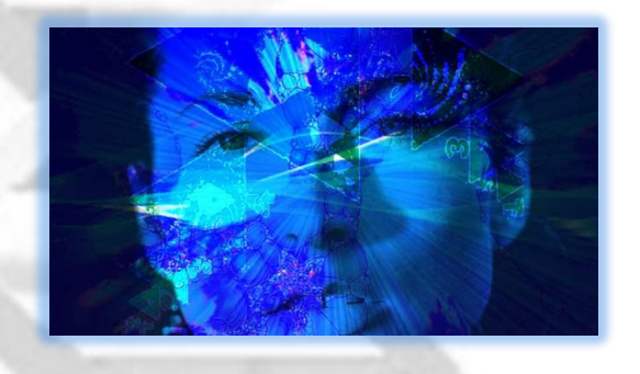
I am a visionary.