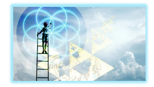
I am a coach or a healer.