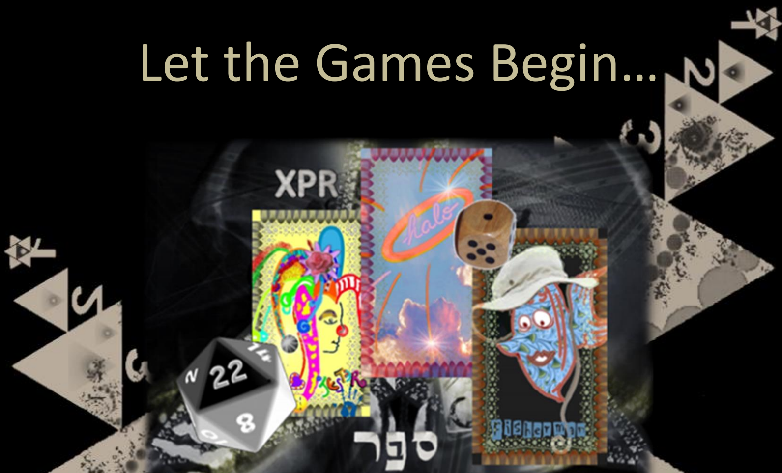
Illustration: S/Hebrew word rpc (evolved into English XPR) for “light, numbers, letters and sounds.”